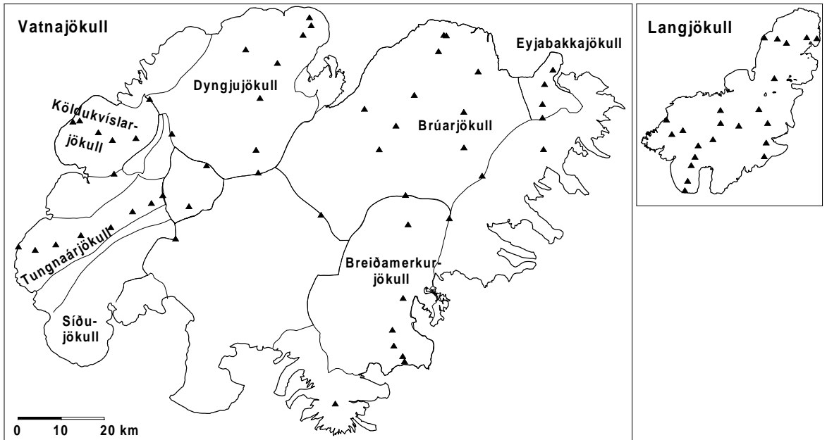
Figure 1. Typical location of mass balance stakes on Vatnajökull and Langjökull. Ice divides, separating various outlet glaciers, are drawn on Vatnajökull. – Lega mælistika við afkomumælingar á Vatnajökli og Langjökli. Línur á Vatnajökulskorti afmarka skriðjökla.

zero in 1994–1995 but since then it has been negative. The winter balance was highest during the first years of the decade, reached a minimum in 1996–97 and has since then been slowly increasing. The summers were colder during the first half of the decade, which is reflected in the summer ablation. The high ablation during the summer of 1997, however, was too a large extent caused by low average albedo following the exposure of the tephra layer from the Gjalp eruption in October 1996. Moreover, dust from Skeiðarársandur, originating from the jökulhaup deposits in November 1996, also spread over large parts of the ice cap. In contrast the high summer melting in 2000 was primarily attributable to warm and windy weather. The total mass loss 1991–2001 has been 2.37 m (water equivalent) or 19.4 \text{ km}^3 (which amounts to 1.5 times the average winter balance of the ice cap), i. e.